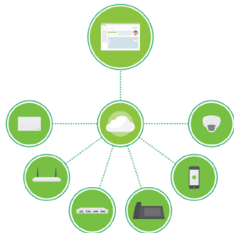
Meraki's cloud management unifies control of users, applications and devices